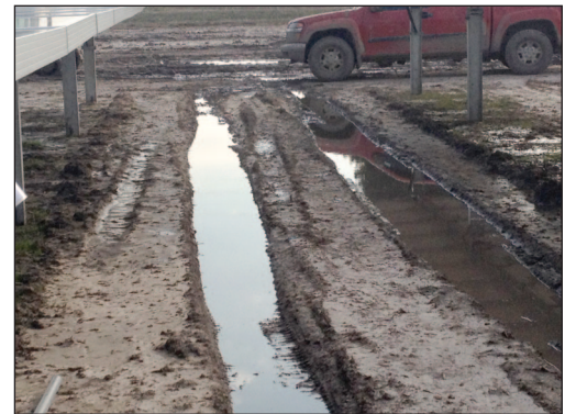
Trenching trouble leads to delays and possible penalties.