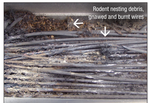
Rodent nesting in tray causes fire and system shutdown.