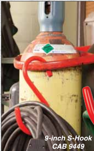
9-inch S-Hook CAB 9449

SAFE, STRONG, DURABLE AN INDUSTRY FAVORITE