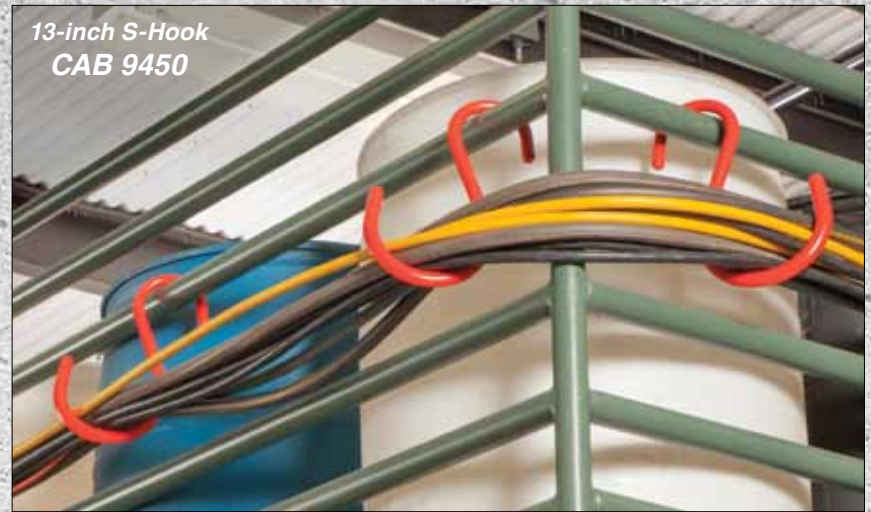
13-inch S-Hook CAB 9450