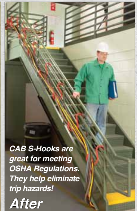
CAB S-Hooks are great for meeting OSHA Regulations. They help eliminate trip hazards!

BEFORE: Messy cables and hoses are a major tripping hazard. Floor traffic increases possibility of crimping or breakage, possibly disrupting important production workflow. CAB S-Hooks are the answer.