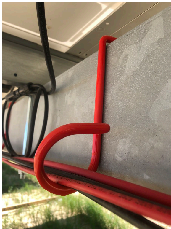
Figure 3: Torque Tube Hanger Supporting String Conductors

A new addition to the CAB Products family of solar hangers is the Torque Tube Hanger. Given the continued strong growth in tracking systems for PV systems, hangers that use the torque tube for support, rather than a messenger wire can be a simple and cost-effective way to support cables running parallel to the main support torque tube. Since these torque tubes often rotate 90 degrees or more when tracking east to west, the hanger must encircle the cables to keep them in the hanger. Figure 3 shows an example of a typical CAB Torque Tube Hanger installation.