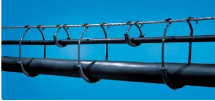
Figure 1: Two Cable Systems on the Same Messenger Wire

accomplish the same separation objective is shown in Figure 2. In Figure 2, the cable hanger has several separate sections to separate dc and ac, as well as provide for communications and other cable needs.