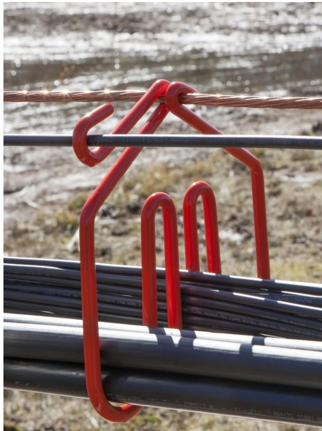
Figure 2: Multi-Carrier CAB Solar Hanger

accomplish the same separation objective is shown in Figure 2. In Figure 2, the cable hanger has several separate sections to separate dc and ac, as well as provide for communications and other cable needs.