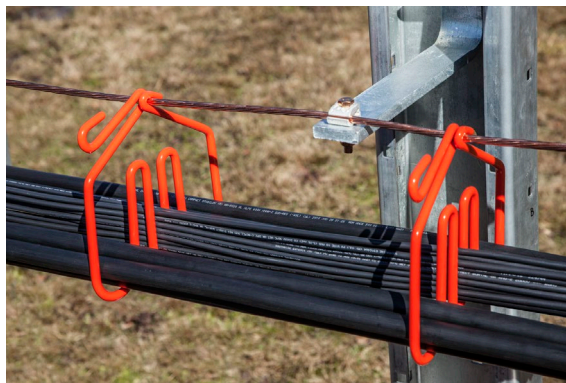
Figure 4: CAB Solar Hangers with PVC Coating

Ultimately, the AHJ must approve any equipment used in a PV installation under their purview. Most, if not all Solar Hangers are coated with a durable non-conductive coating designed to prevent damage to the cable. This prevents the metal of the hangers and saddles from coming in contact with the cable as shown in Figures 4.